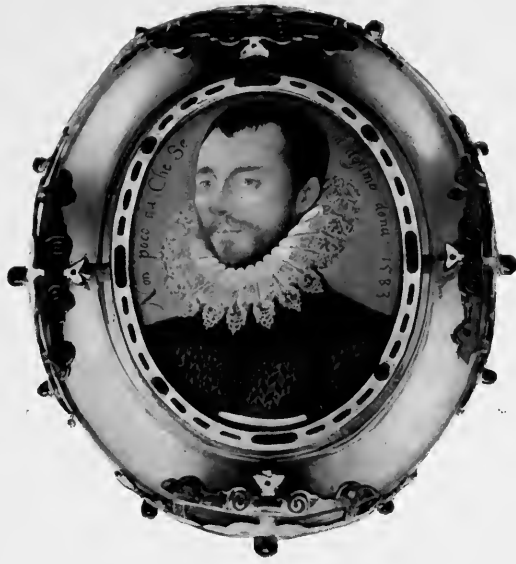
PHILIP II., KING OF SPAIN BY ISAAC OLIVER